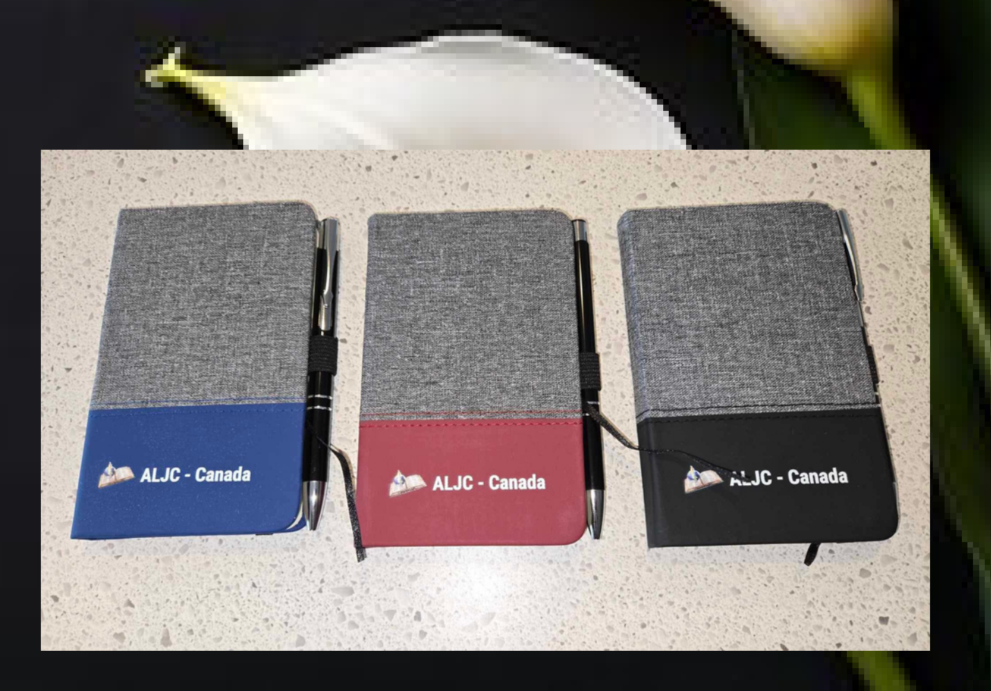
Gifts for everyone From ALJCC