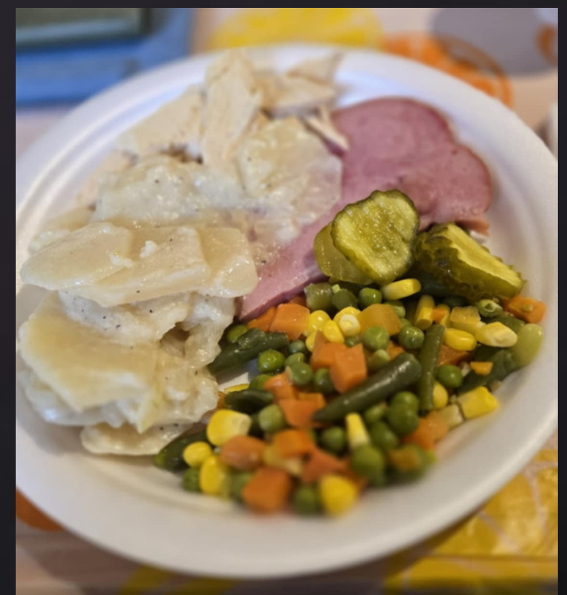
Food & Fun:)