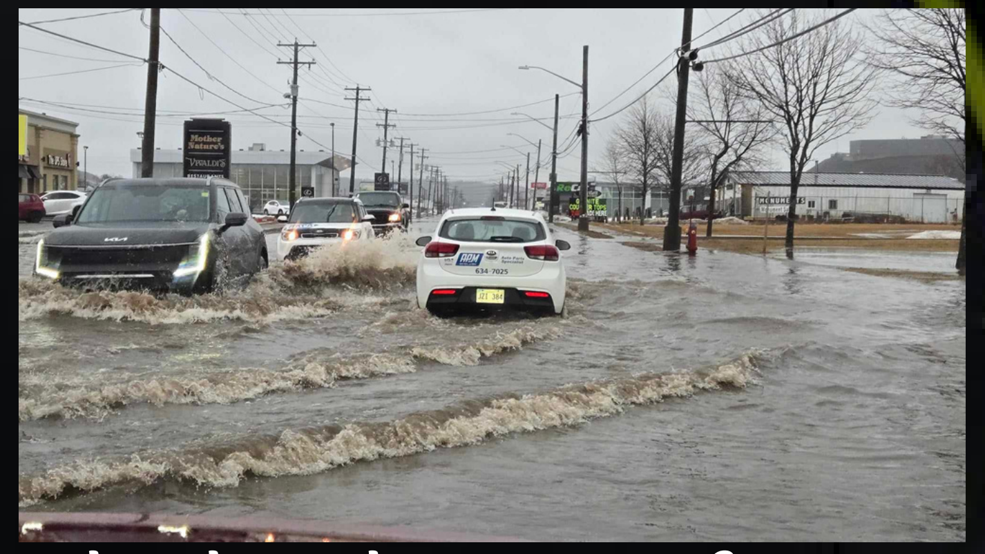
Flooding during Conference