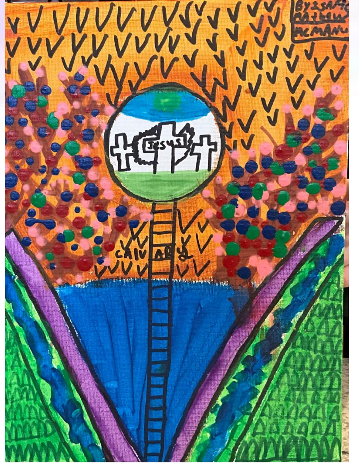
By Isaac McManus